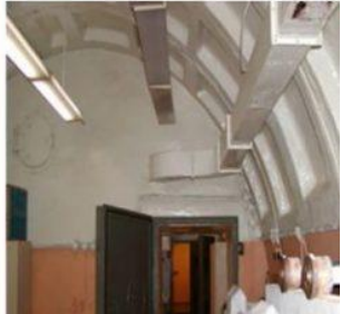
Figure 1: Underground rooms with gamma spectrometer and Low Activity Liquid Scintillation Analyzer in Khlopin UL.